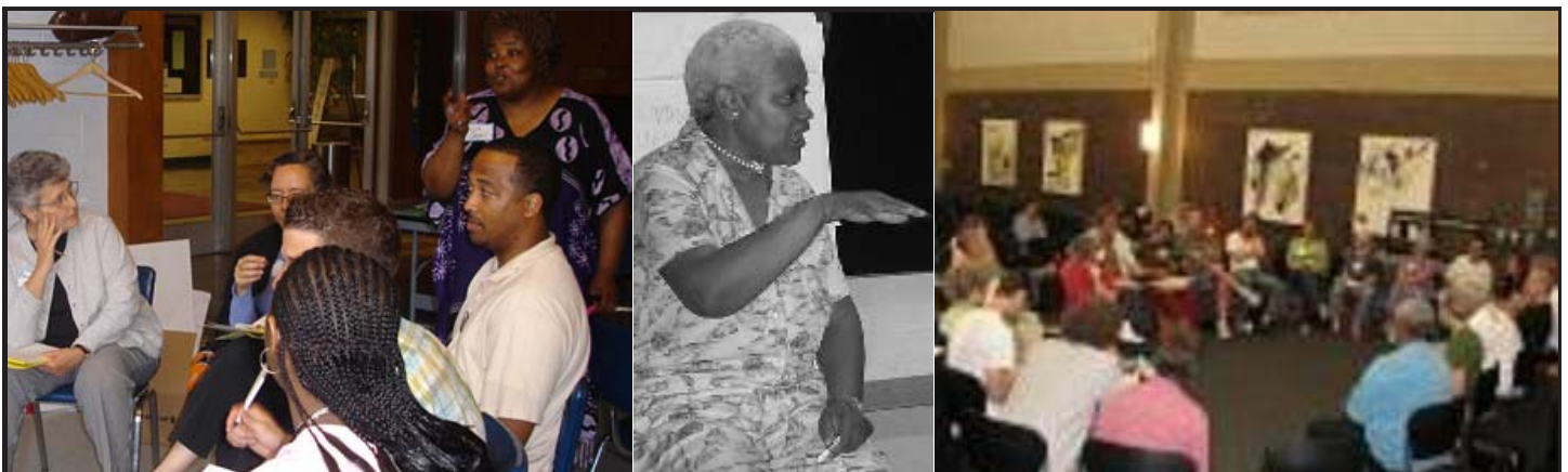
Water for Life discussions in Detroit and Milwaukee