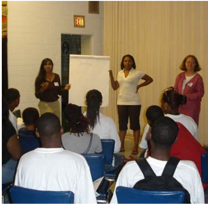
Environmental Health Presentation